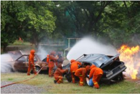
Firefighters fighting fire during training