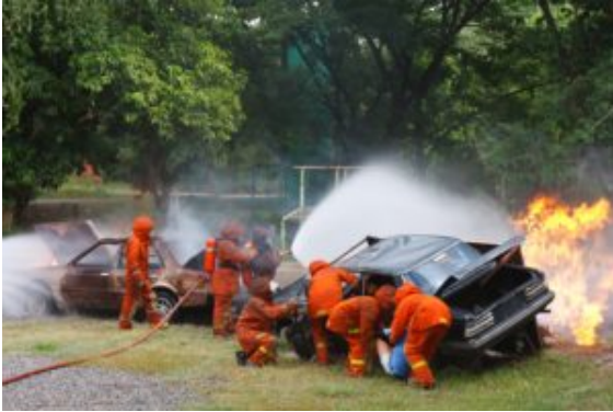
Firefighters fighting fire during training